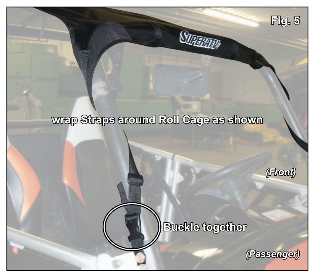
(illustrations continue on following pages)